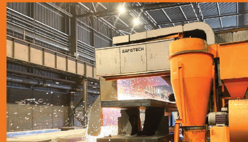
EVERTZ grinding machine with « Reveal CAST » automatic surface defect detection system